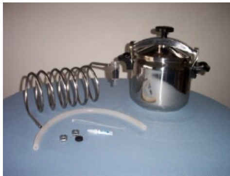
Photo Above: Life Saver Stainless Steel Multi-Purpose Steam Pot with Condensing Coil, Charcoal Post-Filter, Hook-Up Tubing and Accessory Items for the Life Saver Distiller Kit.

The Life Saver Distiller Kit weighs less than 1 Kilo [2.2 pounds] and can be stored in a minimum amount of space when not in use.