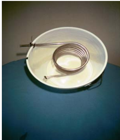
Extra High Capacity Food-Grade 316L Stainless Steel Condensing Coil. Installed in 5 gallon plastic bucket

For the most rapid production of Distilled Water, the Life Saver Water Distiller uses 10 feet of Medical/Food Grade 316L Stainless Steel Tubing in its condensing coil.